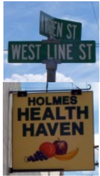
Buy granola and freeze dried soups