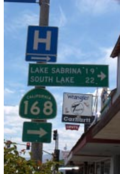
Go West on 168 (W Line St)